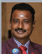
Sundaram Natarajan Aditya Jyot Eye Hospital, Mumbai, India