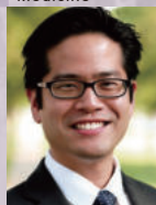
Yoshihiro Yonekawa Wills Eye Hospital, USA