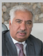
Khalid Al Sabti Kuwait Specialized Eye Center, Kuwait